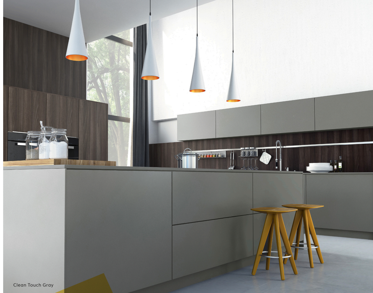
Clean Touch Gray